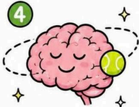
4 Sharper FOCUS