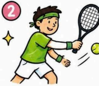
2 Better FITNESS