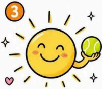
3 Boosted MOOD