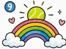
9 Healthy LIFESTYLE

♥ ONE GAME. MANY BENEFITS. PLAY TENNIS, FEEL AMAZING! ★