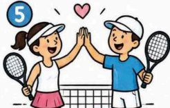
5 New FRIENDSHIPS