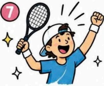
7 More CONFIDENCE