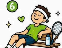
6 Less STRESS