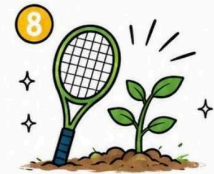
8 Personal GROWTH