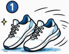
1 More MOVEMENT